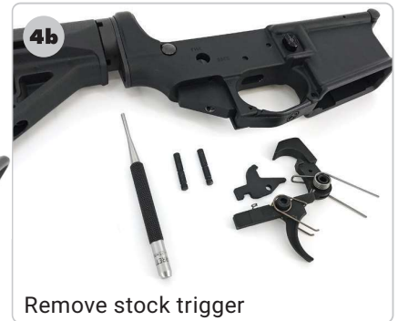
Remove stock trigger