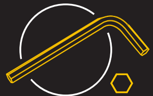
Flat head or hex key to remove pistol grip